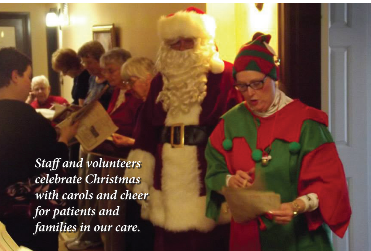
Staff and volunteers celebrate Christmas with carols and cheer for patients and families in our care.