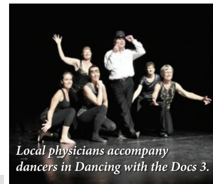
Local physicians accompany dancers in Dancing with the Docs 3.

who purchased tickets, supported a hiker, donated prizes, made an in memoriam donation, invited us to speak to your service club or volunteered their time and talent to make all of the fundraising initiatives successful. It takes a community to build a hospice.