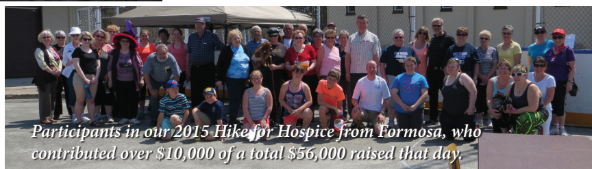
Participants in our 2015 Hike for Hospice from Formosa, who contributed over $10,000 of a total $56,000 raised that day.