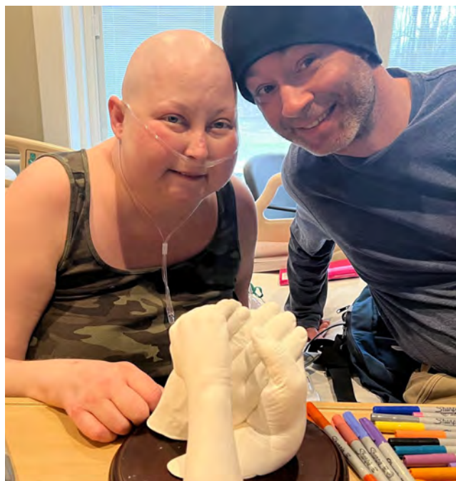
Legacy project hand mould done by the whole family

being a terminally ill cancer patient. She could cherish precious moments with her boys, creating memories that would last a lifetime.